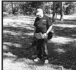
The author is shown here first setting the grid and then walking it using the Mini unit. Once recorded, the grid findings can then be saved for future reference.

Like most detectorists, I had often dreamed of "seeing" into the ground. The Arc-Geo Logger was about to open up new areas I had put on the back burner