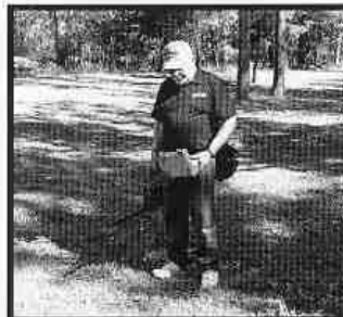
The author is shown here first setting the grid and then walking it using the Mini unit. Once recorded, the grid findings can then be saved for future reference.

Like most detectorists, I had often dreamed of "seeing" into the ground. The Arc-Geo Logger was about to open up new areas I had put on the back burner