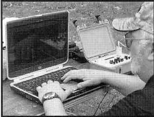
A laptop or PC is required to download the information obtained from the Arc-Geo unit.